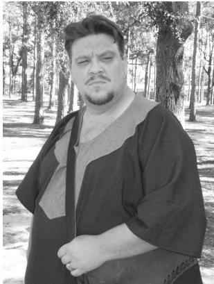
Senechal Bastion d' Sint Michel